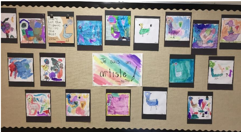
Mme. Heyde's Kindergarten drawings for "Don't Let the Pigeon Drive the Bus"