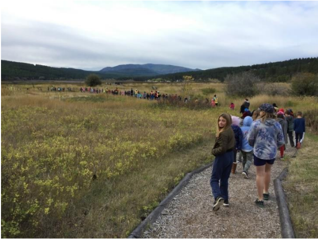
All 350 students walking in honour of Terry Fox.